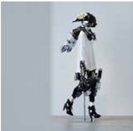
Picture 6 Ikeuchi Hiroto, Tokyo's Sai Gallery 2022 the exhibition https://www.saiart.jp/