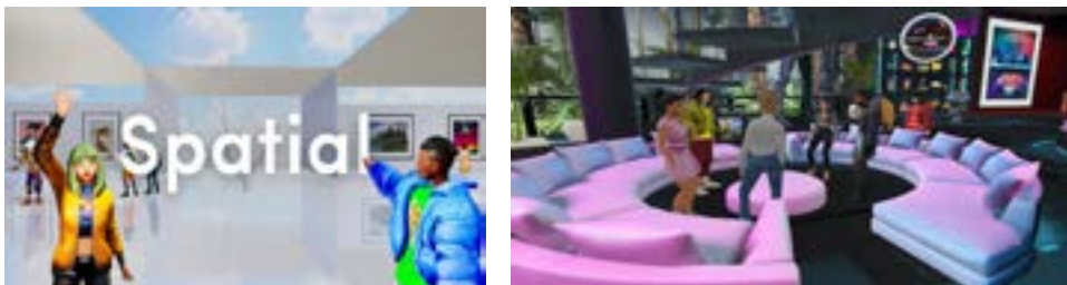
Picture 1 SPATIAL.IO Augmented Reality Meta-Verse play space https://www.spatial.io